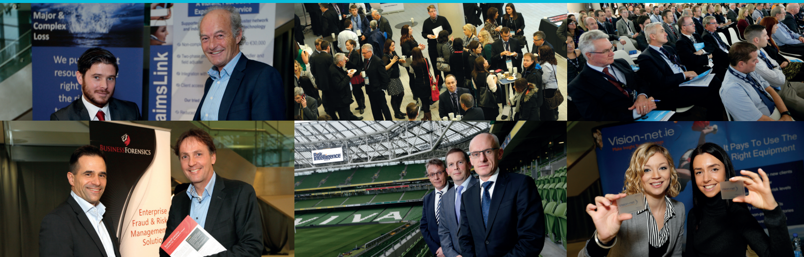
Insurance Ireland's anti-fraud Conference 2014 - Understanding the True Impact of Fraud - featuring our Platinum Sponsor Risk Intelligence, sponsors Vision-net.ie and Cunningham Lindsey and exhibitors Business Forensics

This confirmed our own suspicions as an industry but is also a timely reminder of the fact that there can be no let-up in our efforts not only to fight fraud but also to convince the public that it is not just a problem for the industry. This highlights once again the gap in public perceptions of the industry and the reality faced by our members every day and the need for Insurance Ireland to intensify its work in communicating that reality as widely as possible.