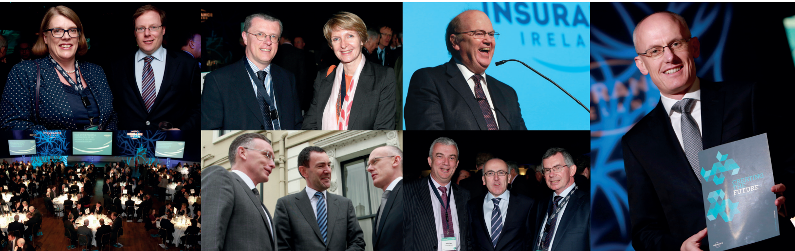
Insurance Ireland's Annual Industry Lunch 2014 with guest speaker Minister for Finance Michael Noonan TD marking the launch of the PwC Report - Creating the Future for Insurance in Ireland

Pensions continued to be a key issue both for the industry and society and in September we published a report entitled "A Universal Pension for Ireland" as well as organising a number of events dealing with the topic.