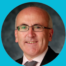
Managing Director, New Ireland Assurance, Insurance Ireland President

To conclude, I would like to take this opportunity to express my gratitude to all of our staff for the tremendous hard work they have put in during the year in organising a record number of events and conferences, representing our sector across a wide policy and regulatory agenda, and