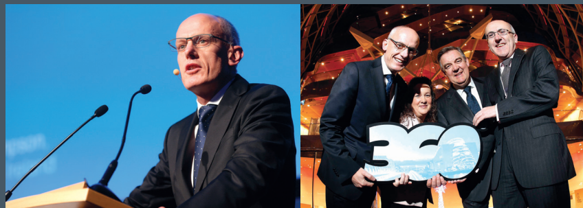
Insurance Ireland's Inaugural President's Conference 2014 - Customer 360°

To be the voice of the insurance industry and recognised as a centre of excellence by our domestic and international stakeholders