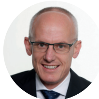
CEO Insurance Ireland