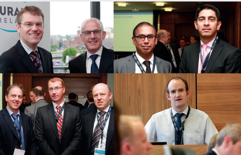
The Insurance Ireland - Milliman Chief Risk Officer Fora Series 2014