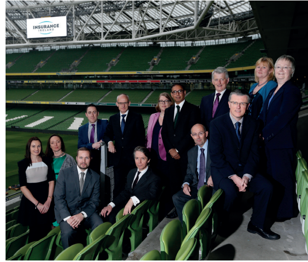
The Insurance Ireland Team

There were 35 events held by Insurance Ireland in 2014, up from 8 in 2013