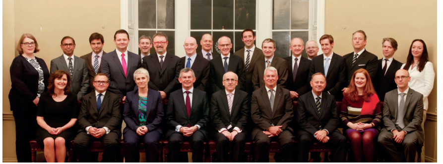
A gathering of our International CEOs at the National Gallery of Ireland